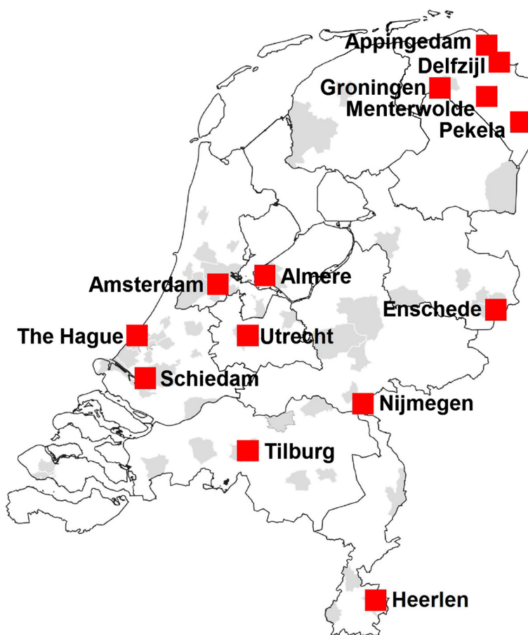
Figure 3 Participating municipalities in the 'Healthy Pregnancy 4 All' project.

services. Organisation and logistics regarding out roll of the two sub studies is presented in the specific design papers.